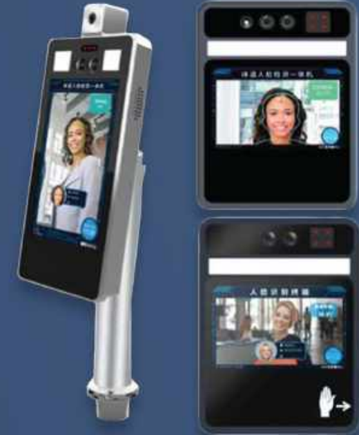
Temperature Thermal With Face Recognition Screening Terminal Screening Device

Evaluation of results and access granted